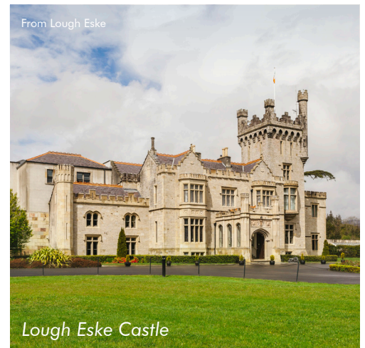
Lough Eske Castle