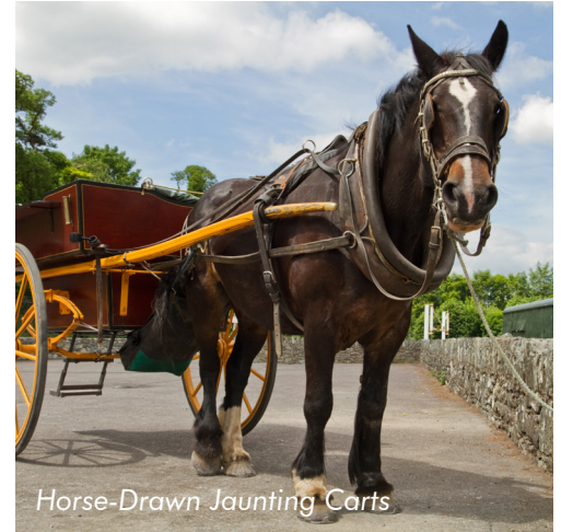
Horse-Drawn Jaunting Carts